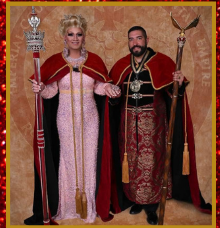
Reign L Emperor L Goliath Steel Empress L Sophia Sexton