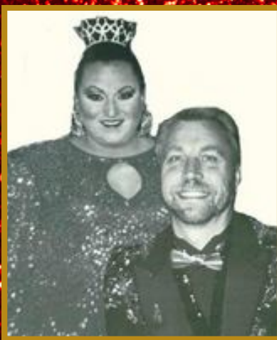
Reign XXII Emperor XXII Thom Frey Empress XXII Alyssa Del Rey