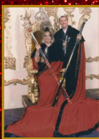
Reign XXV Emperor XXV Tom J Empress XXV Kir Royale